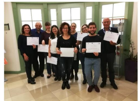
Transnational project meetings

You are welcome to join our proposal to overcome challenges and offer support during the first steps of developing the necessary skills for migrant entrepreneurs.