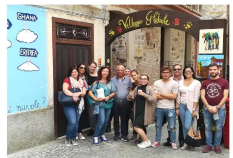
Joint Staff Training Event