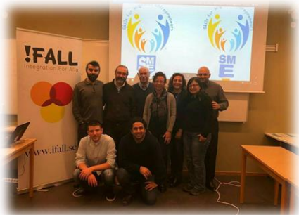
!FALL - Integration För Alla