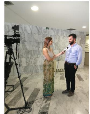
Transnational project meeting

You are welcome to join our proposal to overcome challenges and offer support during the first steps of developing the necessary skills for migrant entrepreneurs.